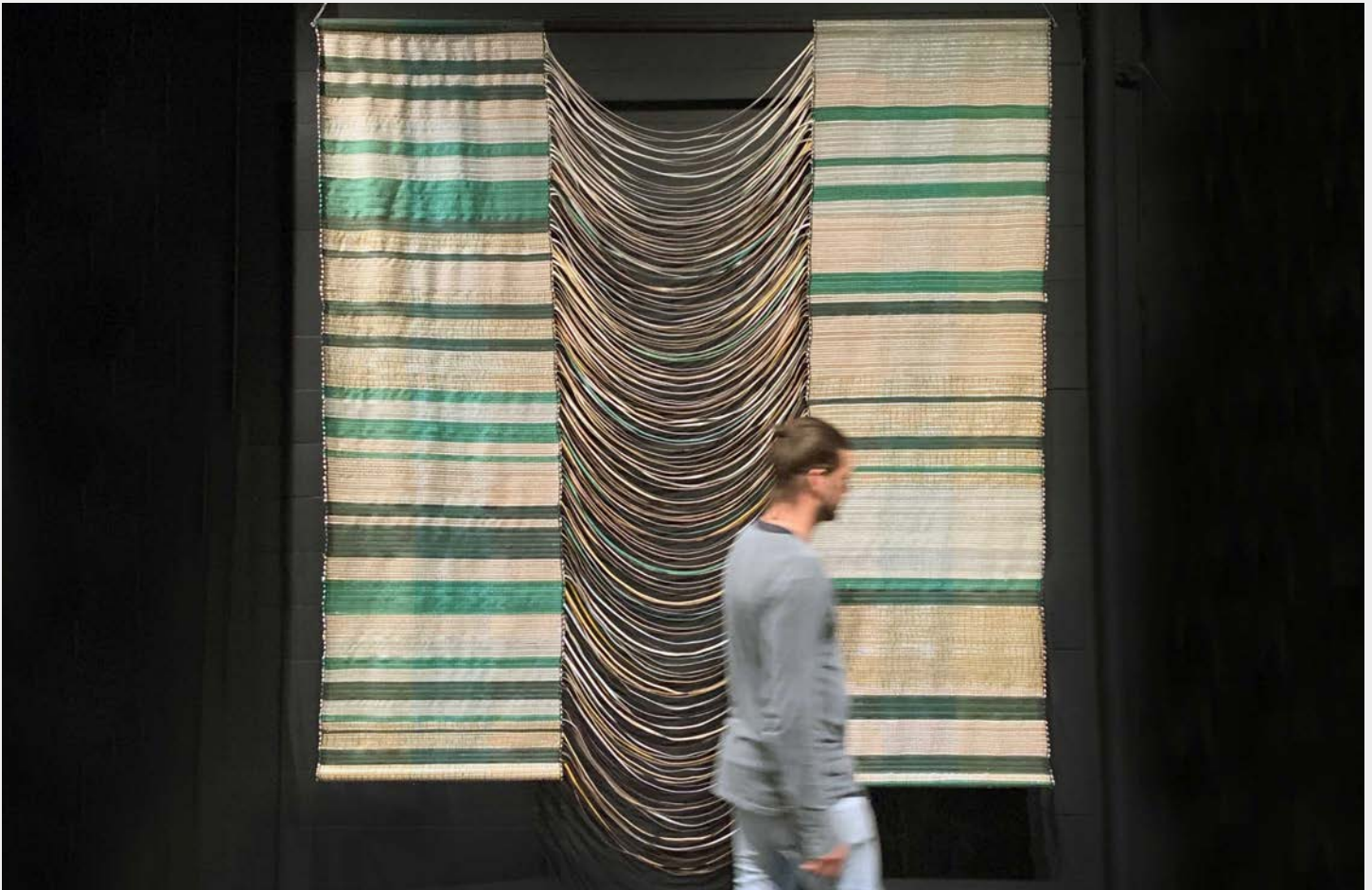
Tethered | Moss

This piece Tethered was hand made in 2019 for NYC Design week. It explores the tension between two elements which were formed together, being pulled apart. Structured yet loose, as if it's taking a breath between moments in life.