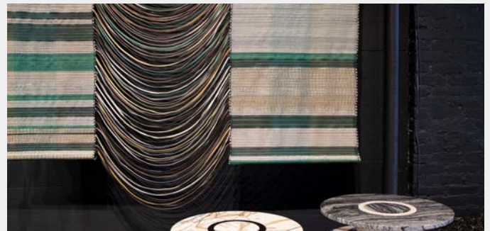
Tethered | Moss

We welcome commissions of all scales including large site specific installations.