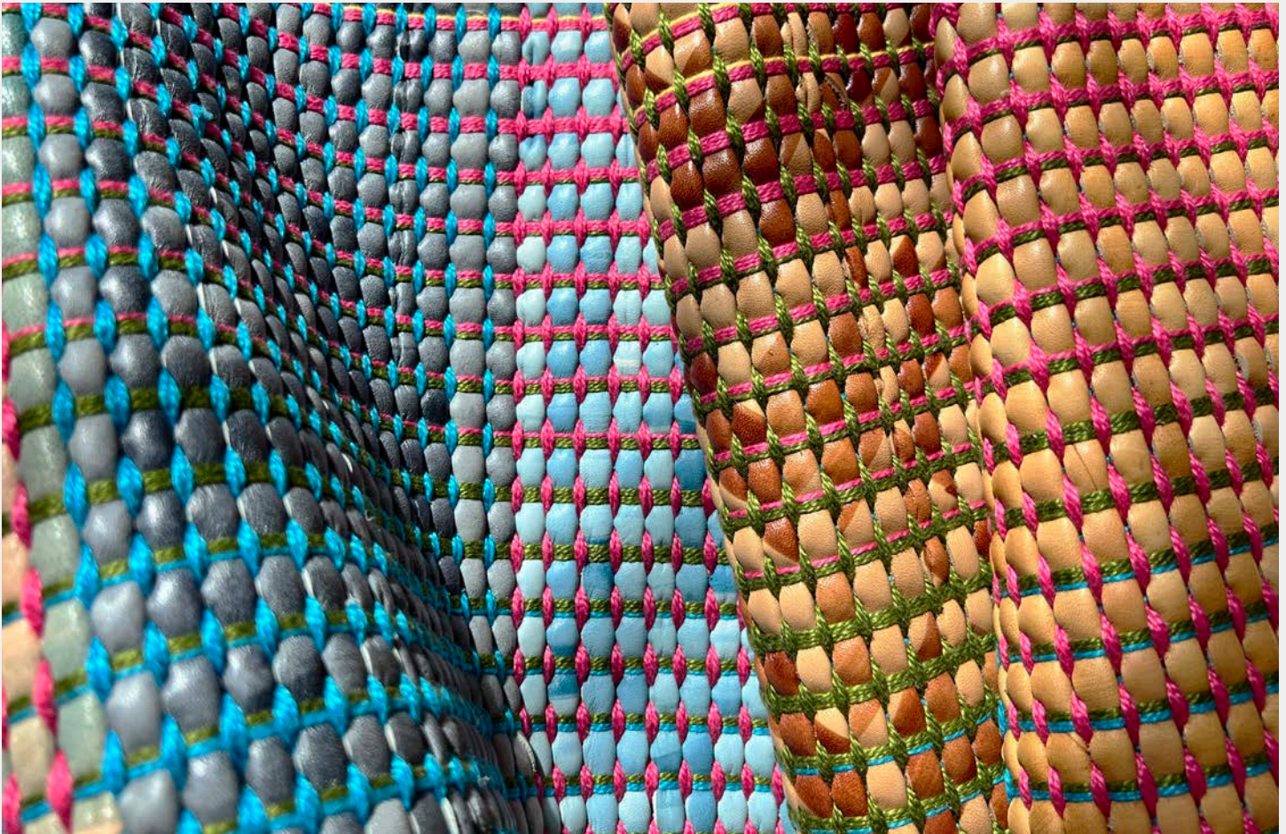
Railroad | Constellation

Railroad has a grid like structure that gives you two strong elements to play with in design. Double ply cotton warp and folded leather weft to create a smooth and resilient surface.