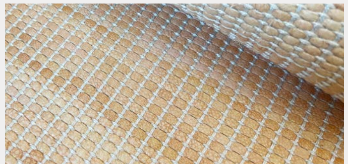
Railroad | Natural

All of our woven rugs are made by hand in the USA and suitable for residential and commercial spaces.