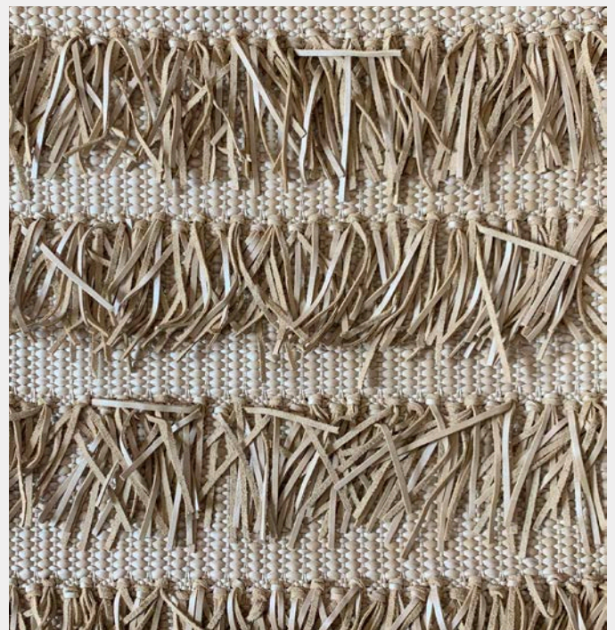
Plume | Natural

Woven leather upholstery is a fresh way to transform your space through material, pattern and color. Reinvent your favorite chair or create statement pieces for each room from scratch. All of our woven upholstery is made by hand in the USA and suitable for residential and commercial spaces.