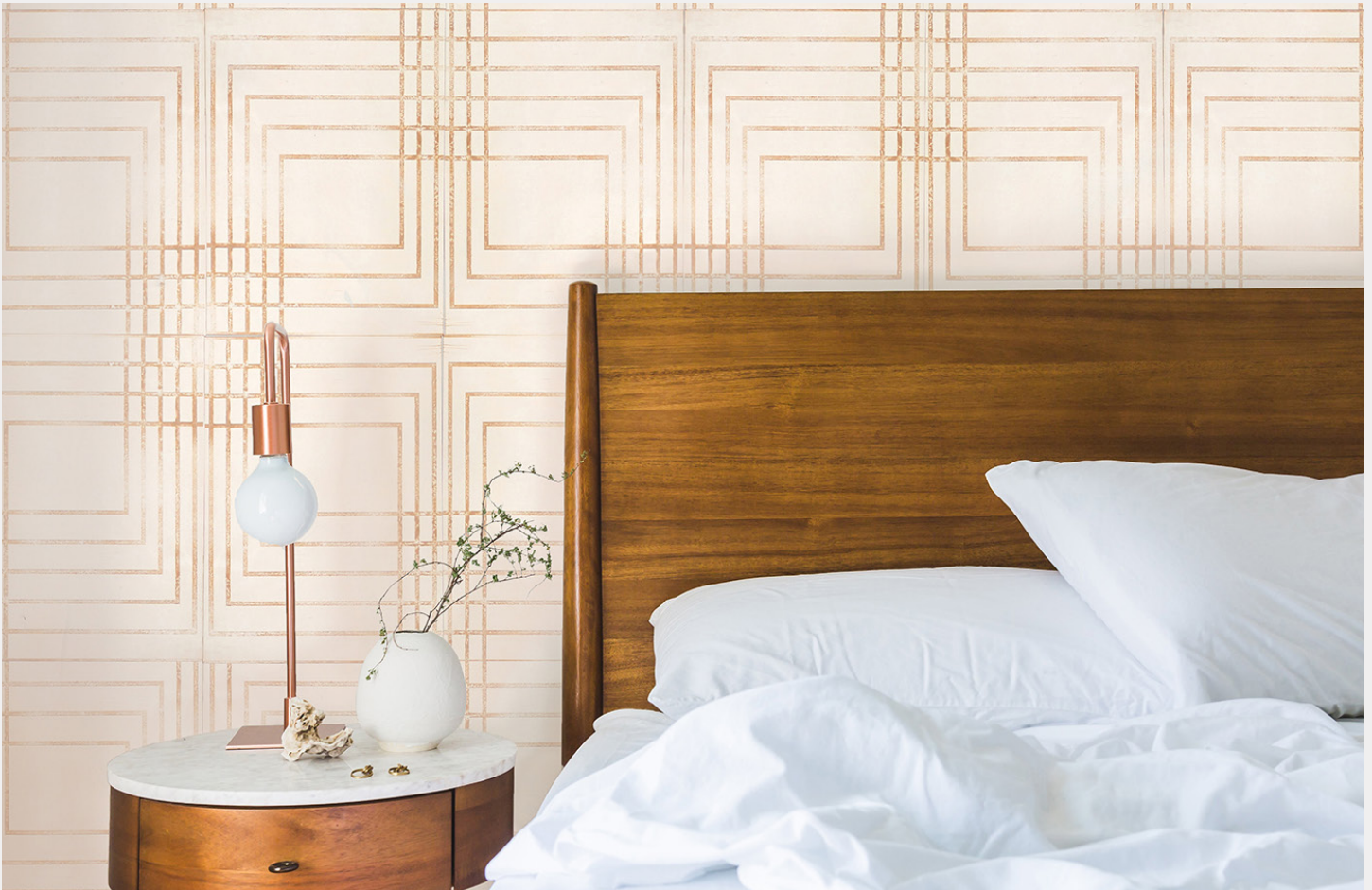
Transit | Gold with white wash

Our Transit tile has a timeless feeling. Made from a structured block print, it is multi directional and ever changing.