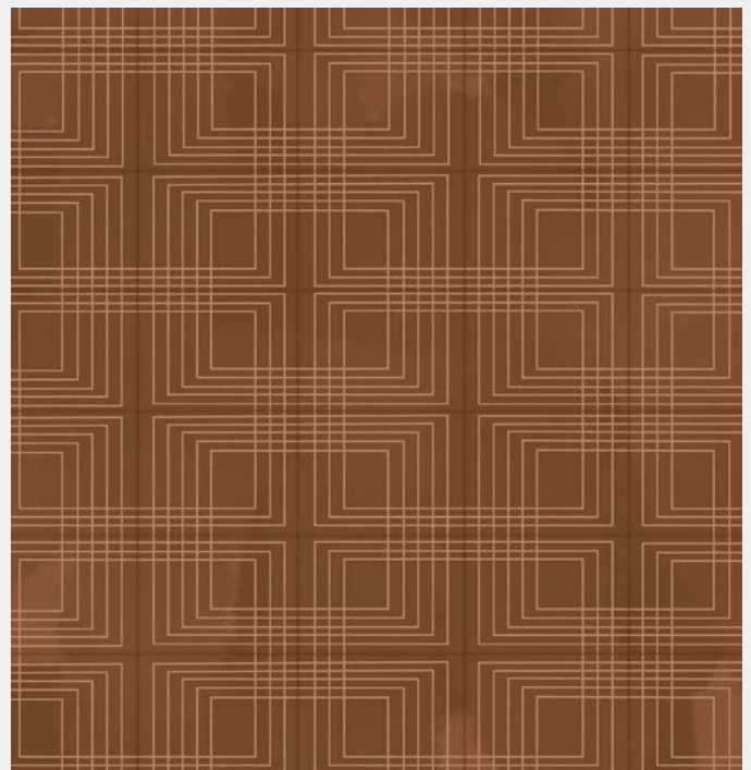
Transit | White with tannin wash

Leather wall tiles add unique material warmth to any space and are easy to install and care for. They have the ability to increase sound dampening when applied to walls and make for tactile inlay on cabinets or table tops. All of our tiles are made from heavy weight leather that we dye by hand.