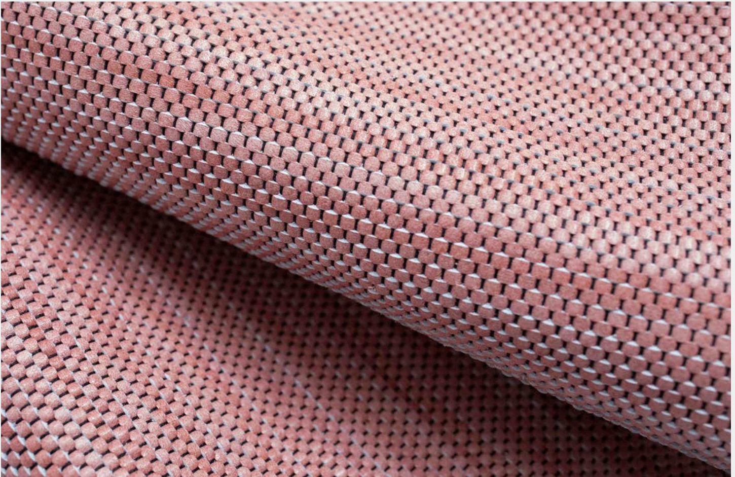
Canvas | Vintage Coral

Sometimes the simplest is the most beautiful. Canvas is a compact woven textile made from hand dyed leather for a subtle depth of tone. It's perfect for high use applications and has endless possibilities of color.