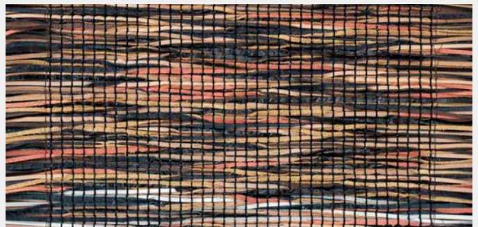
Cascade | Volcano