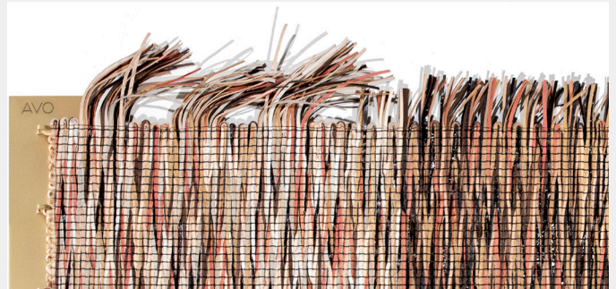
Cascade | Mantle

We welcome commissions of all scales including large site specific installations.