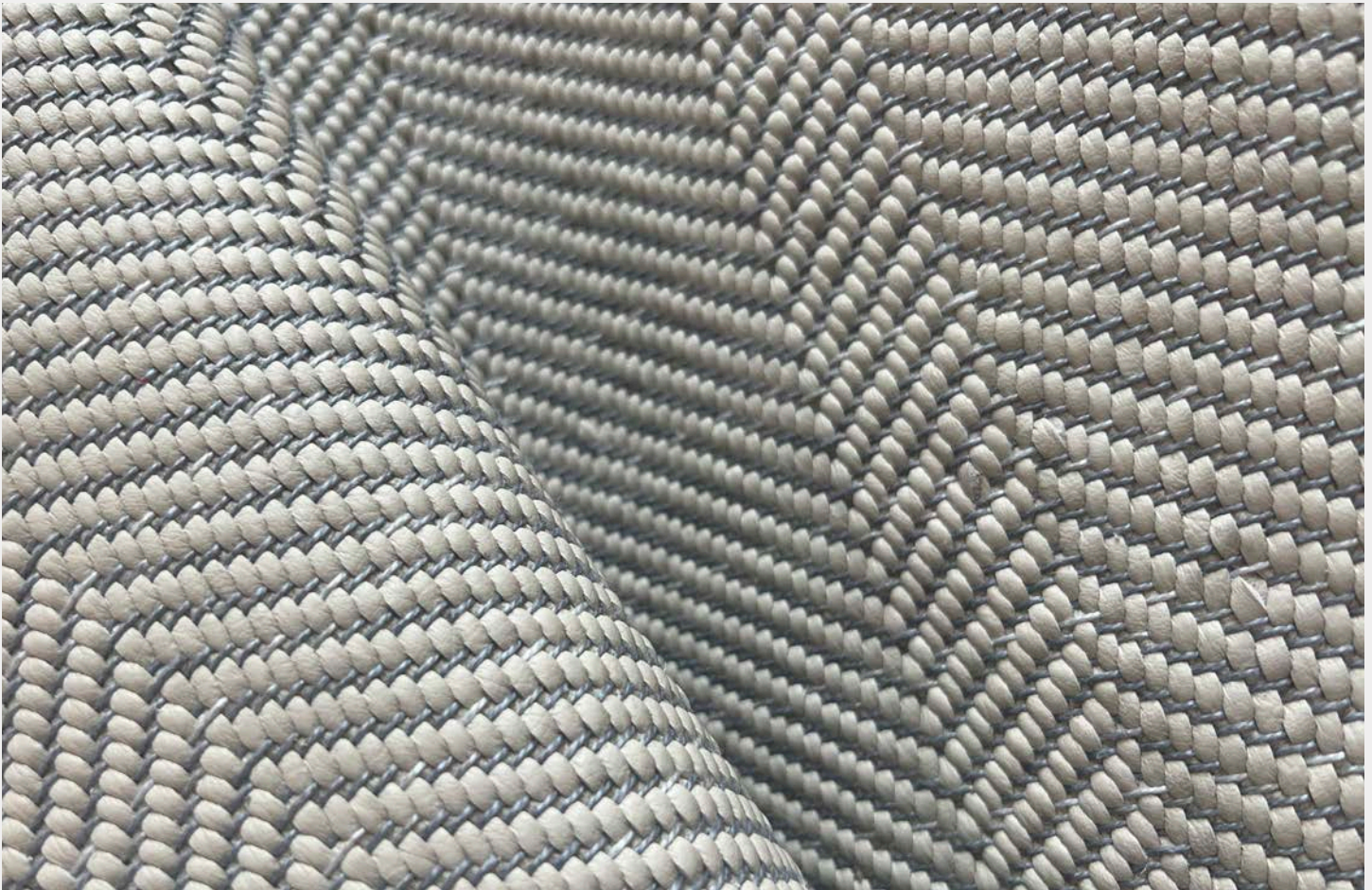
Herringbone | Bone Grey

Our herringbone weave is classic and refined. It is woven with a fishbone pattern to have a sultry drape.