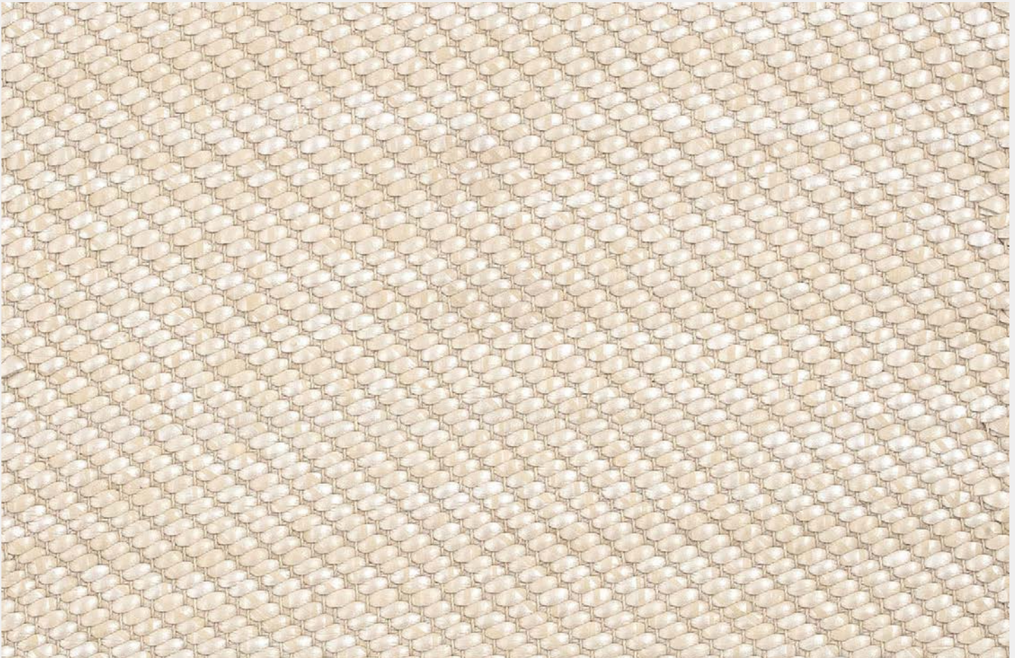
Twill | Frosted Pearl

A simple weave with a clean slate to reflect the mood of your space back into your rug. Create dynamic stripes or subtle color scape with Twill as your base. Twill is crafted with a tight weave perfect for high traffic areas.